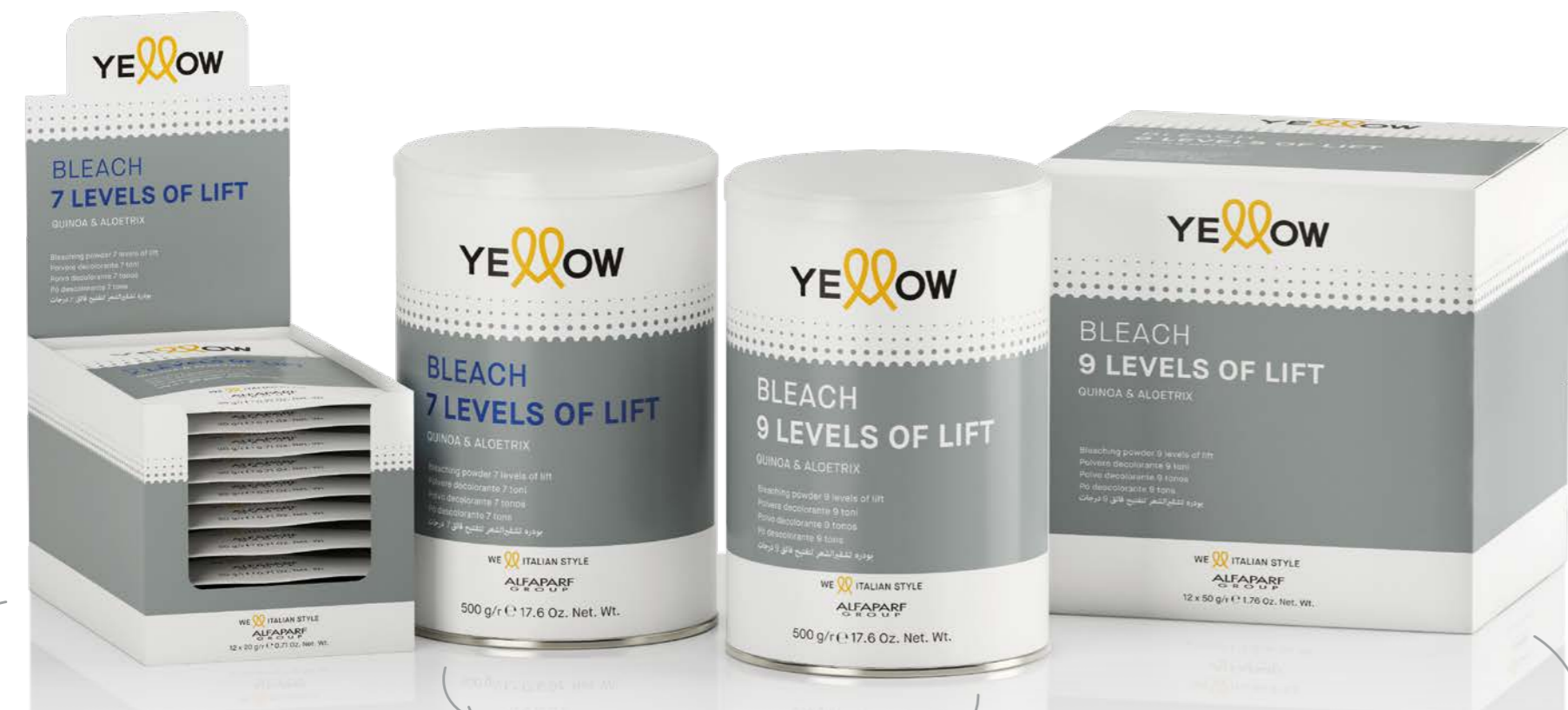
12 X 20 g* SACHET BOX *IDEAL QUANTITY FOR PARTIAL BLEACHING JOBS